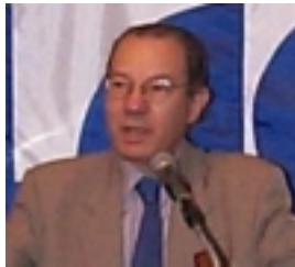
BARBOSA (file photo)

Speaking at a banquet to honor speakers in Pittsburgh for the World Affairs Council's 32nd World Affairs Institute, which focused on the prospects for democracy in Latin America, Barbosa predicted that da Silva would continue to pursue reforms to reduce inflation and the country's fiscal deficit, and create economic opportunities.